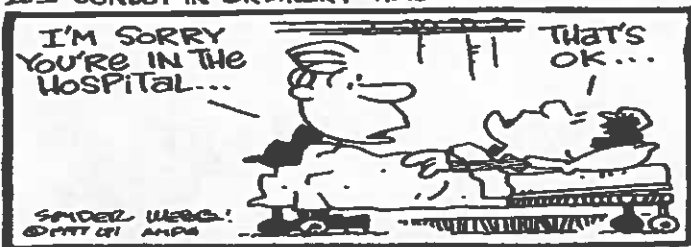
26 TH SUNDAY IN ORDINARY TIME